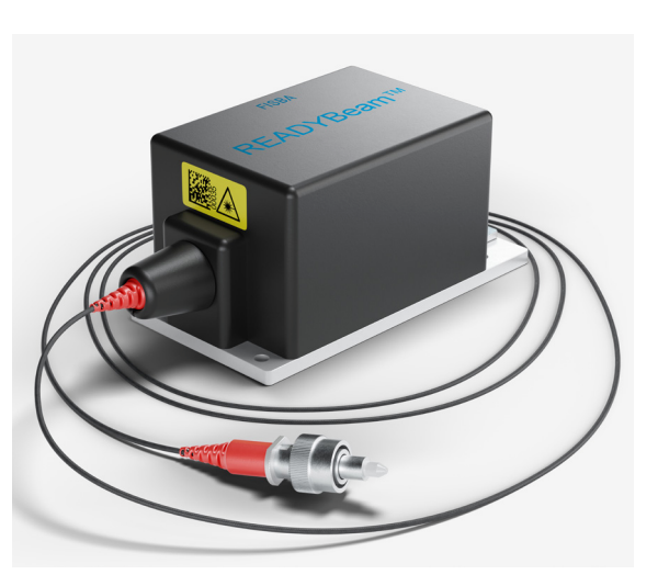
The FISBA READYBeam™ is a compact multi-wavelength laser source.

The READYBeam is the latest embodiment of the FISBA legacy of precision Swiss engineering — a legacy that spans more than 60 years.