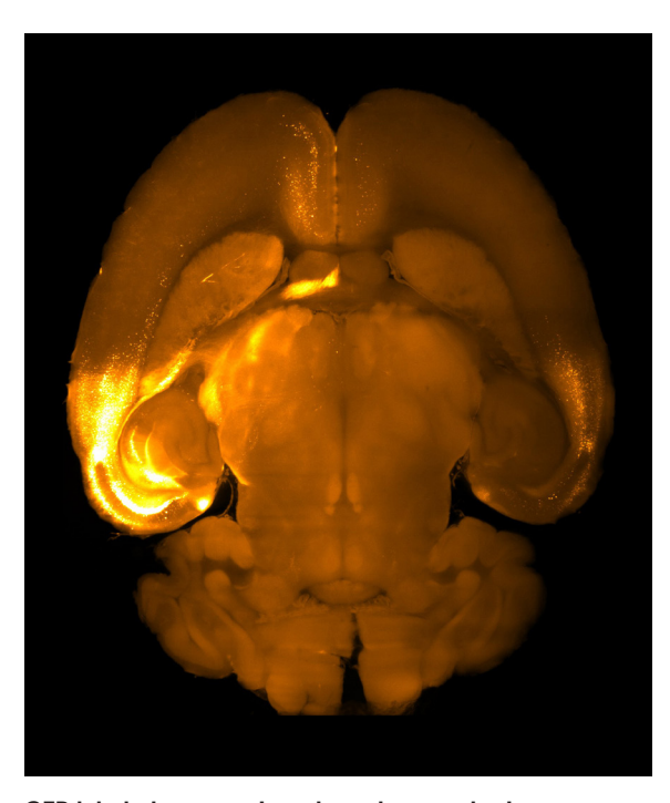
GFP-labeled neurons in a cleared mouse brain. Yasir Gallero-Salas, Fabian Voigt (Brain Research, University of Zurich) using a mesoSPIM light-sheet microscope (mesospim.org).